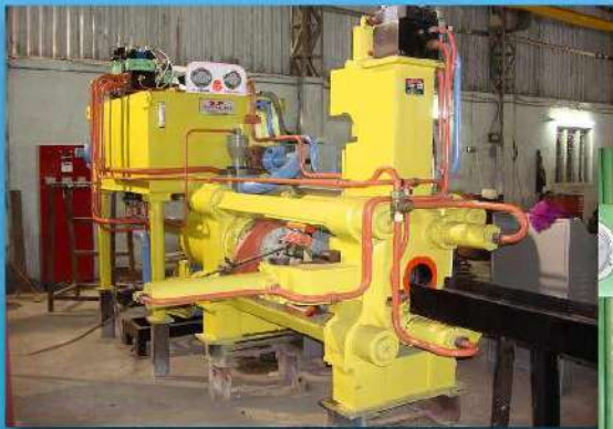
Brass Extrusion Press

Five Star Metal Industries is started with two engineers and one investor at Jamnagar in 1981 started with sole manufacturing job work in Metal Components, we have come a long into in-house turnkey specific industry brand products including design, analysis, manufacturing and testing facility under one roof. With Our high-tech non-ferrous foundry with State-Of-The-Art Technology produces best of quality product in industry.