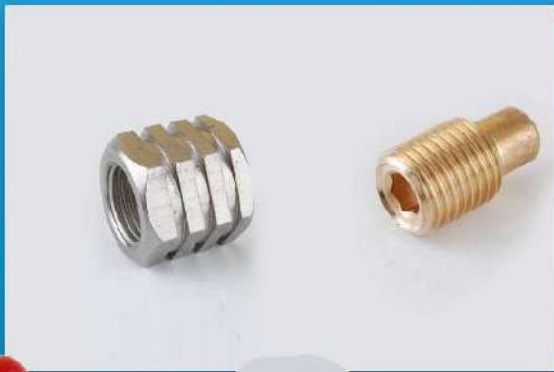
Electro Fusion Fittings