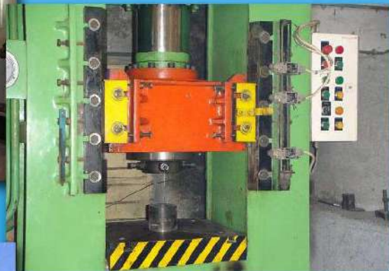
Brass Forging Press