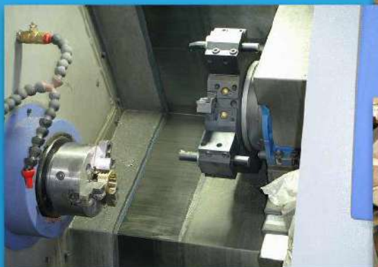
CNC Turning Center